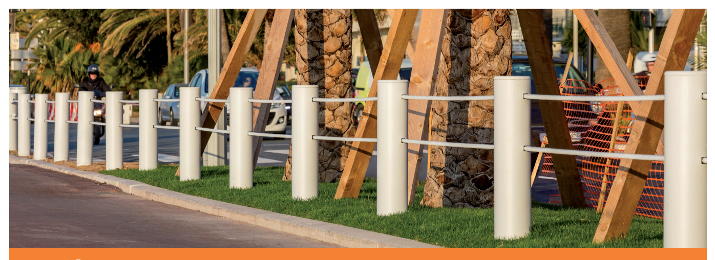
MacSafe® completed installation adjacent to pedestrian zone