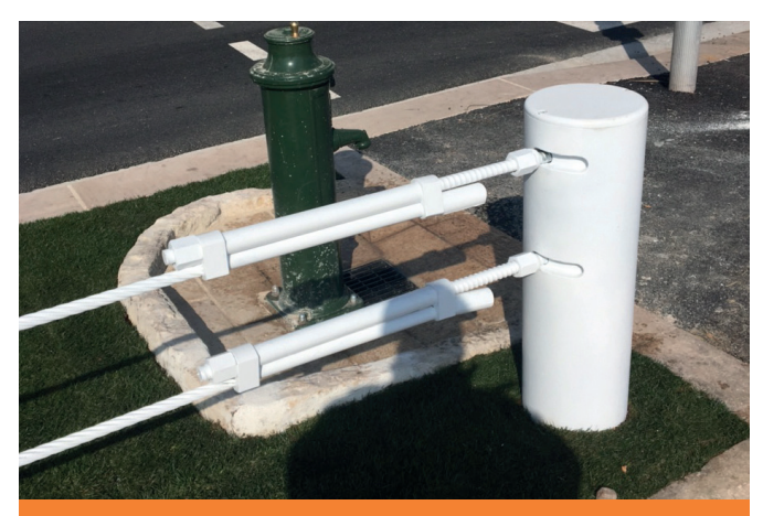
Energy absorption compression brakes