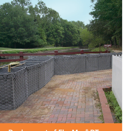
Deployment of FlexMac<sup>®</sup> DT