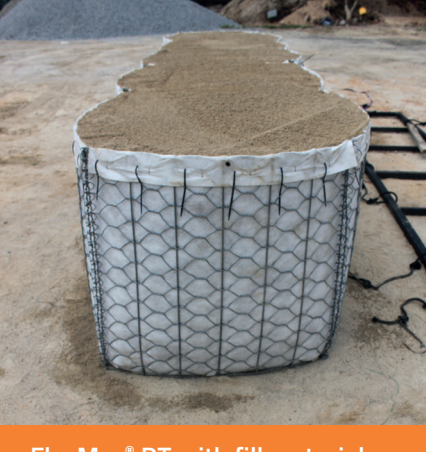
FlexMac<sup>®</sup> DT with fill material