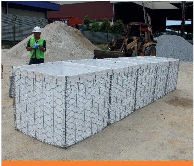
FlexMac® DT unit ready for filling

FlexMac<sup>®</sup> DT can be a temporary or a permanent solution. When used as a permanent solution after the emergency has passed, FlexMac <sup>®</sup> DT can be covered and re-vegetated in harmony with the environment.